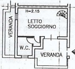
PIANTA PIANO PRIMO